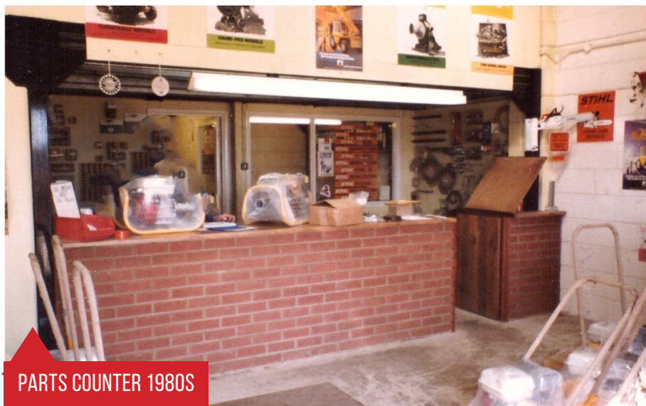
PARTS COUNTER 1980S